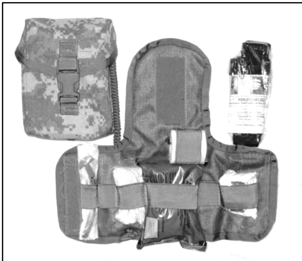
Figure A-1. Improved first aid kit

A-2. See the United States Army Medical Materiel Agency Web site for more information on the IFAK and IFAK II.